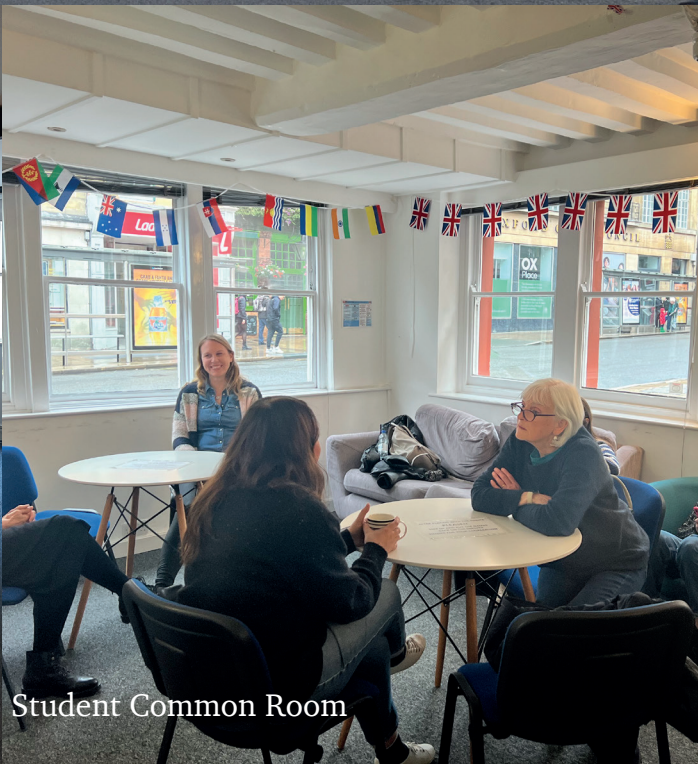
Student Common Room